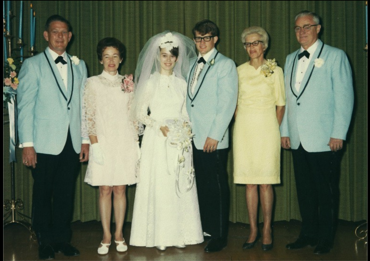
The Woodbys & the Whites